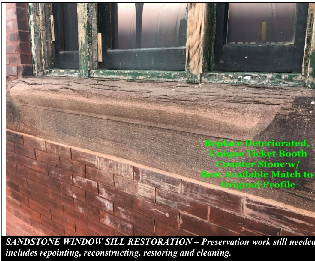
SANDSTONE WINDOW SILL RESTORATION – Preservation work still needed includes repointing, reconstructing, restoring and cleaning.

$825,000 capital campaign. Through July 2022, approximately two hundred donors have contributed a total of $310,178 toward the $550,000 matching funds required to earn the Jeffris grant.