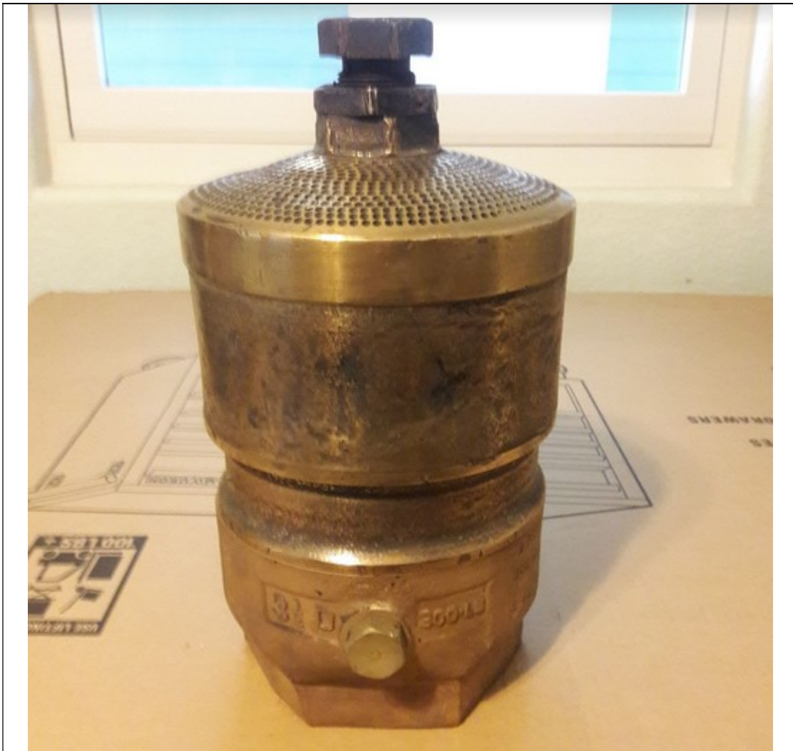
ORIGINAL COALE SAFETY VALVE – Also known as ‘pop’ valves, the grant funding is important to the repair and maintenance of these valves on Number 576.

THANK YOU to the National Railway Historical Society for selecting Nashville Steam and No. 576 for a 2022 Heritage Grant! This $5,000 award will go towards repairing and servicing the locomotive's original Coale safety valves. These critical components, also known as "pop" valves, are safety devices located on top of the boiler and automatically release steam from the boiler once it reaches a certain, pre-determined pressure amount. New safety valve springs were previously funded thanks to a grant from the Joyce Family Foundation.