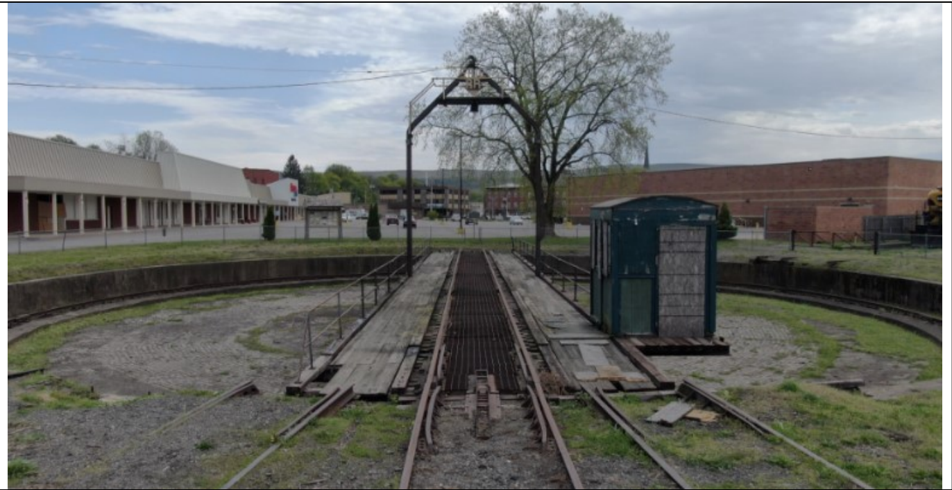
CONDITION OF THE ERIE TURNTABLE BEFORE RESTORATION – The turntable and the Port Jervis Transportation History Center are located on the former site of the Erie Railroad's Port Jervis engine terminal and roundhouse.