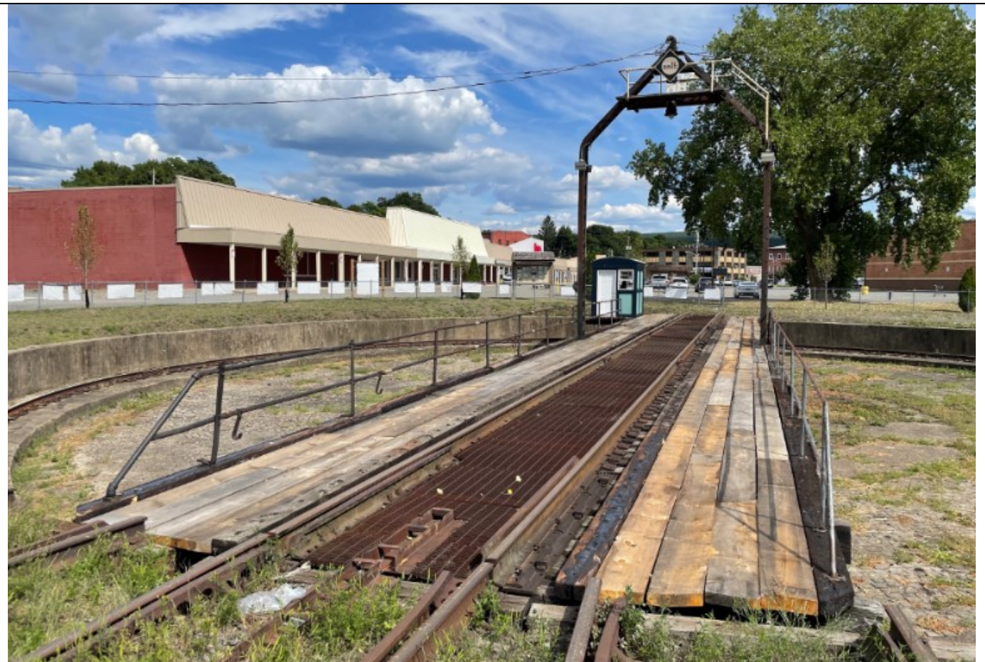
AFTER REDECKING OF THE TURNTABLE – The Erie turntable and its site now have an improved historic appearance and is compliant with safety standards.