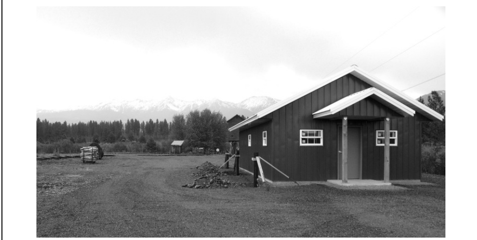
EXTERIOR OF FUTURE HOME OF SVRR ARCHIVE AND LIBRARY – Exterior of the 20 foot by 40 foot structure which will be the home of SVRR’s archive department and railroad library collection.

Sumpter Valley Railroad Restoration, Inc., “SVRR” was awarded a Heritage Grant in 2023 to assist with construction of their new archive and library building. The matching grant was targeted toward the HVAC system for the structure. The new 20’x40’ building at the organization’s McEwen, Oregon site is slated for completion in 2024.