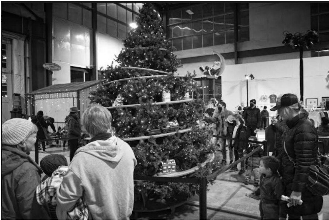
GO ROUND AND ROUND THE TREE WITH THE HOLIDAY EXPRESS!