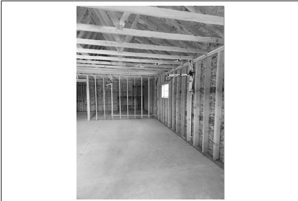
UNFINISHED INTERIOR OF THE STRUCTURE – The interior as shown has a smaller room in the rear which is for secure archival storage, while the larger space will house displays and the organization’s railroad library.

SVRR is best known for running steam and diesel excursion trains on five miles of the original Sumpter Valley Railway right of way. The organization also has a very active archive department focused on the Sumpter Valley Railway, associated lumber companies and Northeast Oregon logging and railroading in general.