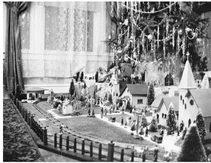
THREE-LEVEL TRAIN DISPLAY - A new tradition that honored the background of both families.

Buildings included both Roman Catholic and Greek Catholic churches. Each represented the two different religious backgrounds of my grandparents. The display would start construction right after Thanksgiving and would remain up through Russian New Year in mid-January.