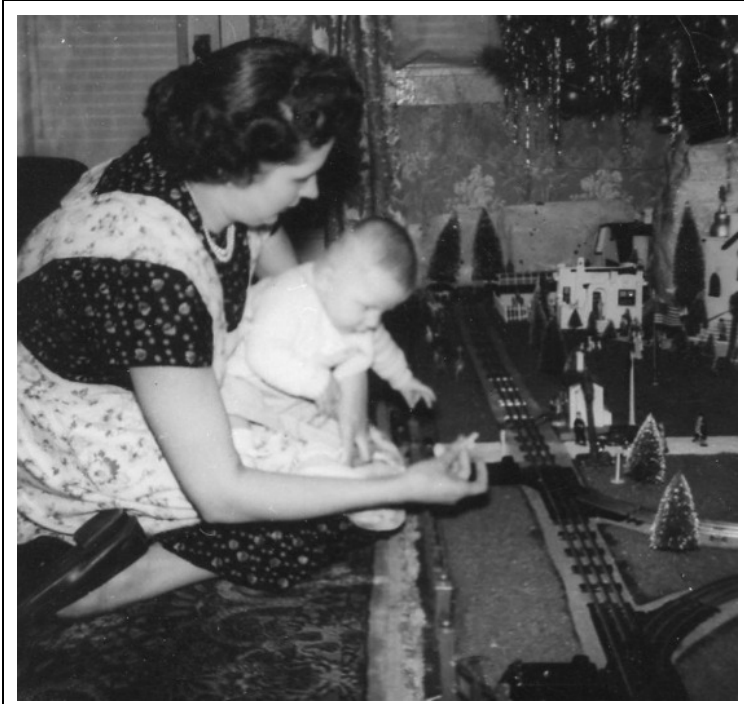
HOW IT ALL BEGAN – Mother, son and trainset.