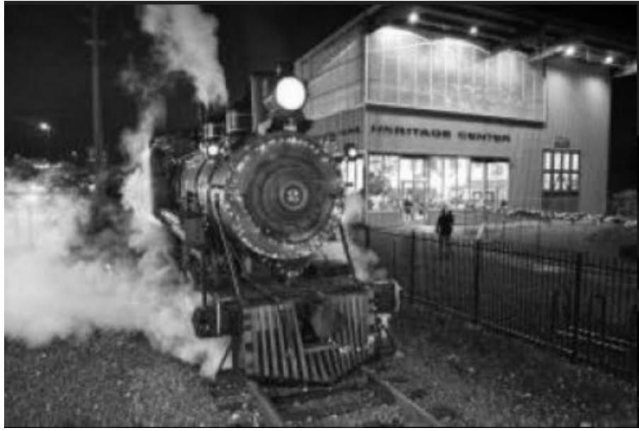
LIGHTS ON FOR THE NIGHT TRAIN – Holiday lit locomotive leads Holiday Express.

For Holiday Express schedule and more about the ORHC, visit their web site at https://orhf.org/train-rides/holiday-express/ . Events, programs and more about the Pacific Northwest Chapter may be found at https://www.pnwc-nrhs.org/ .