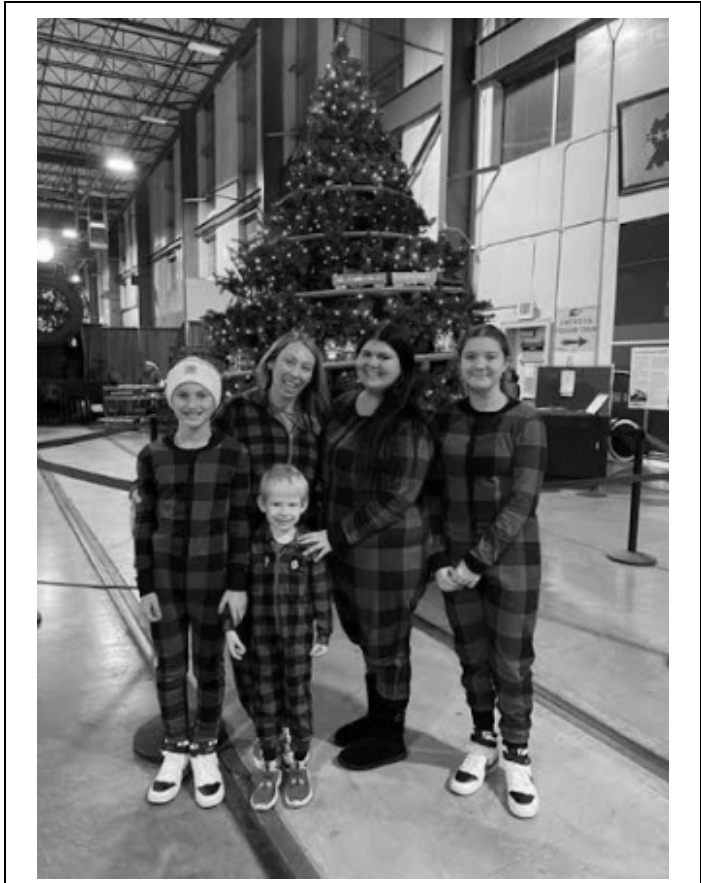
HOLIDAY DRESS-UP TIME – Perfect outfits!!