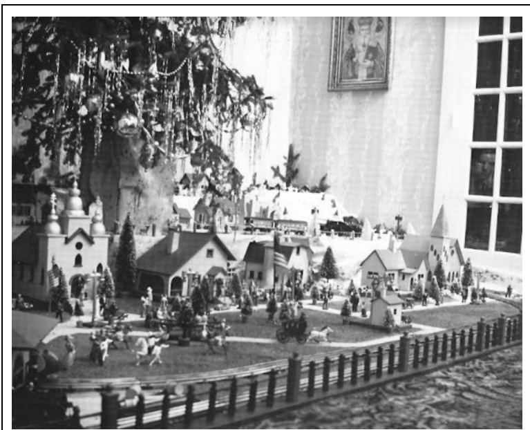
THREE-LEVEL TRAIN DISPLAY – A very detailed layout.

In December, 1951 at my grandparents' house, my grandfather and uncle (John Sr and John Jr Selingo) set up a 3-level Lionel train display in their living room with up to 5 trains running on it. All the buildings were scratch built with scrap wood from my grandfather's place of employment.