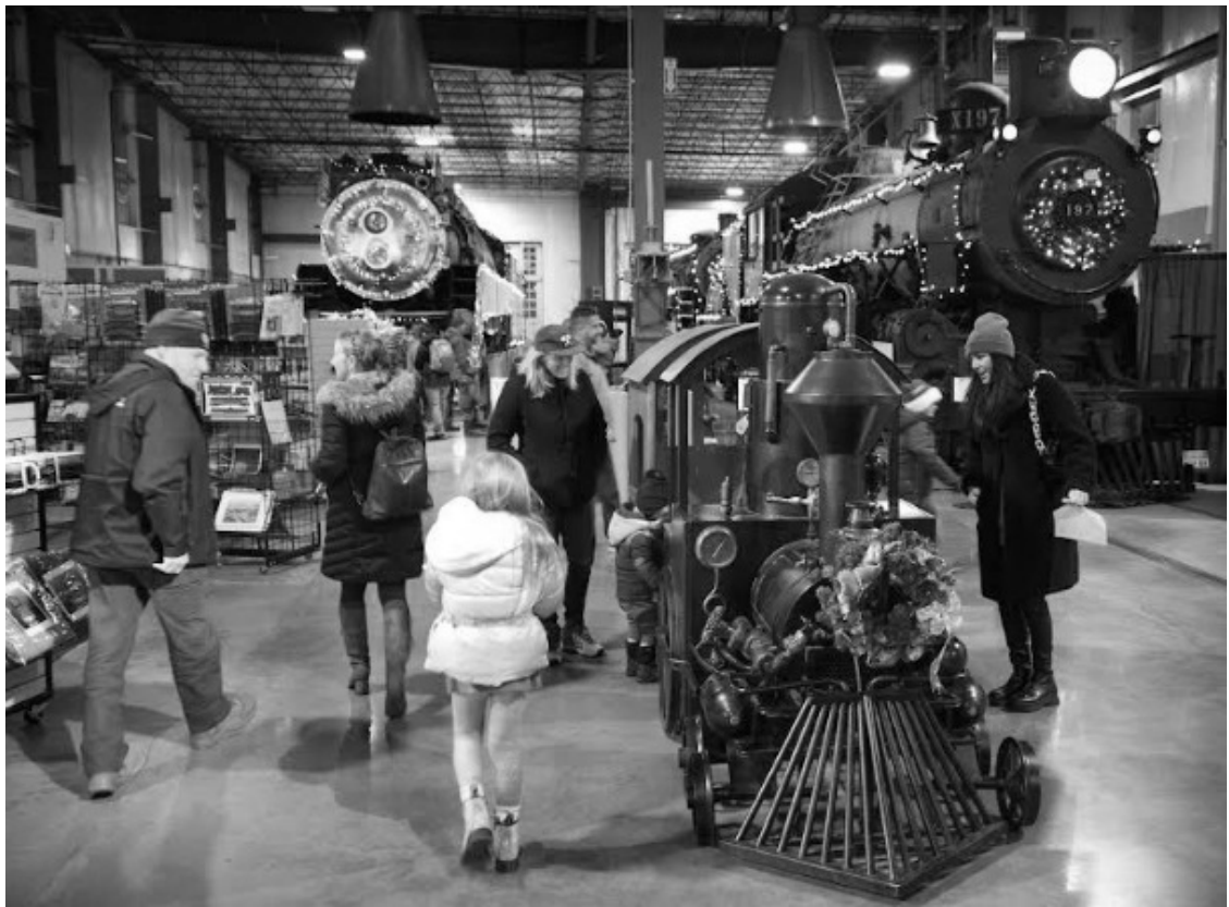
HOLIDAY LOCOMOTIVES – From small to large, as far as you can see.