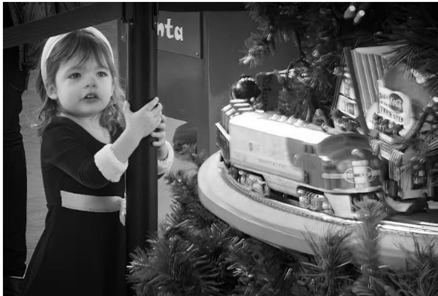
HOLIDAY FUN FOR ALL AGES – Delight, smiles and wonder for kids and adults with trains of all sizes.