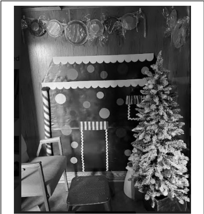
WILL SANTA COME DOWN THE CHIMNEY? – Watch out for the holiday tree!